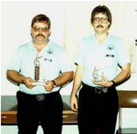
Back in the day